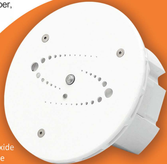
*HALO IOT Smart Sensor - Patent Pending*

HALO's Air Quality Index(AQI) will alert when air quality levels fall in the danger zone for spreading disease, reducing the spread of virus particulates and regularly monitoring to align with industry and government standards.