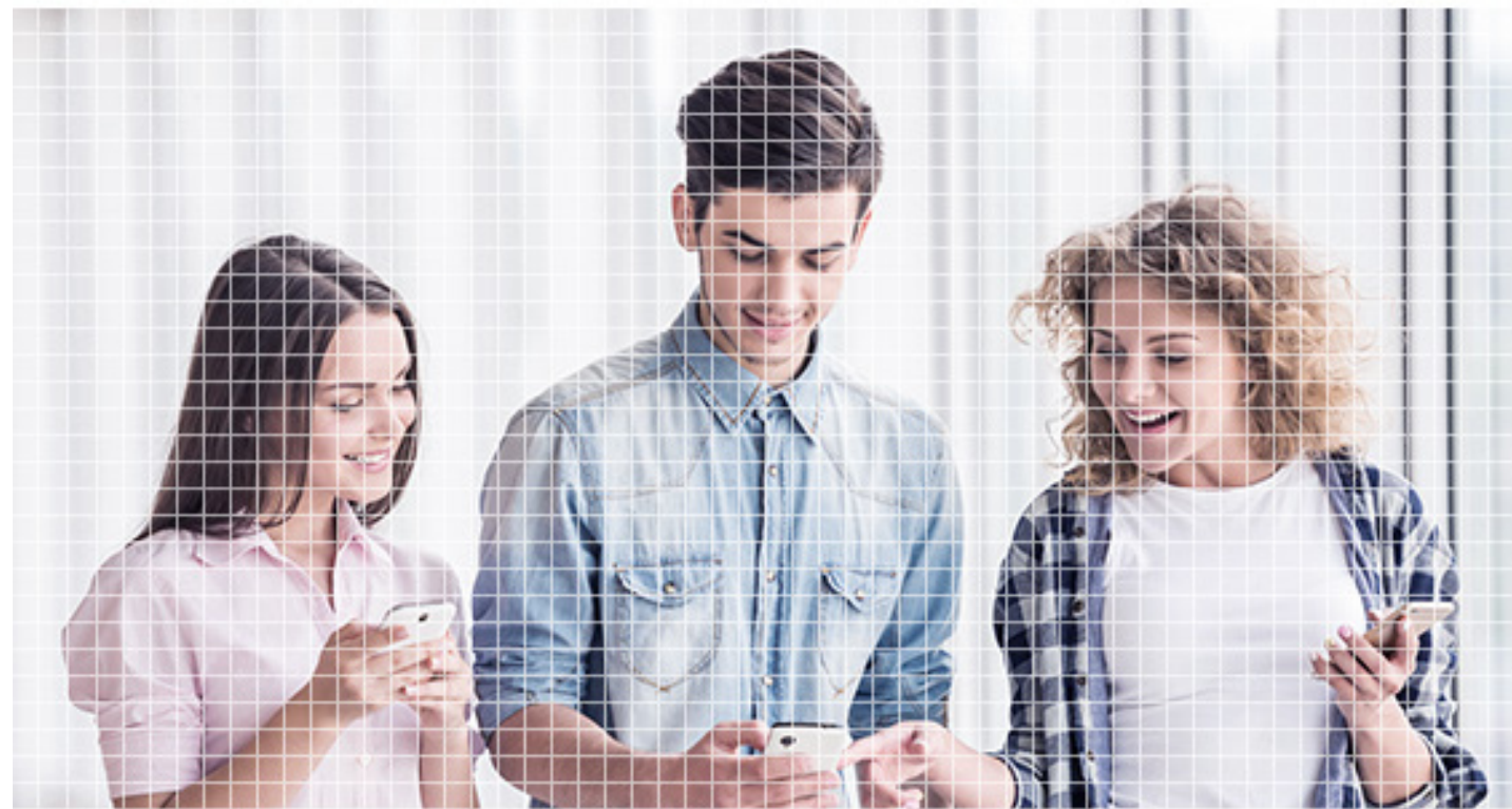
H.264 (Mainstream Video Compression)

The DB2C doorbell features the advanced H.265 video compression technology, achieving better video quality with only half the bandwidth and half the storage space of the previous video compression standard (H.264).