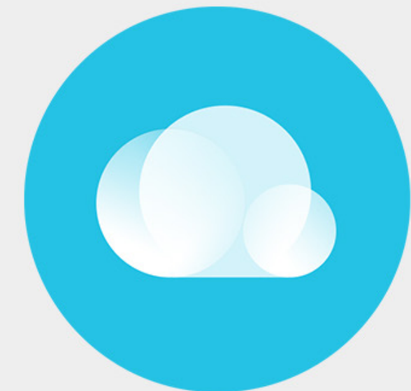
Encrypted Cloud Storage

*MicroSD Card is not included. Cloud storage service is only available in certain markets. Please check before purchasing.