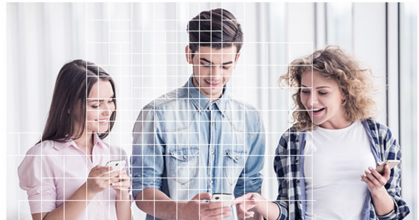
H.265 (Upgraded Video Compression)