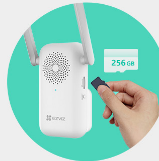
Supports MicroSD Cards

The chime is equipped with a 256 GB MicroSD card slot, allowing you to record more of those special moments. This anti-theft design improves data security compared with conventional doorbells with a slot. You can also save your images to the EZVIZ Cloud for additional back-up.