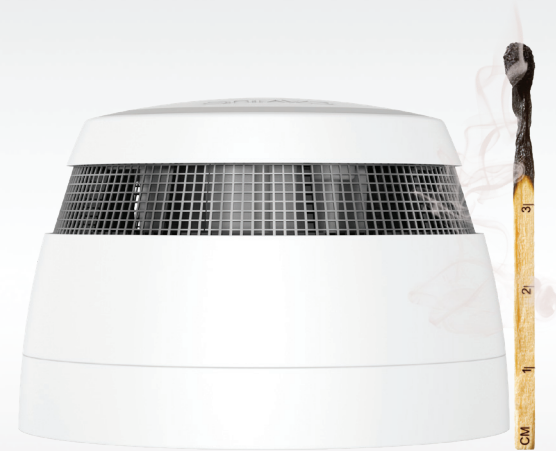
Diameter: 65 mm

PRODUCT NAME: CAVIUS RF SMOKE ALARM, 5 YEAR 65MM