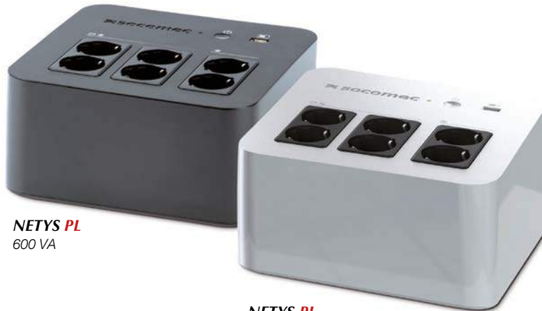
NETYS PL 600 VA